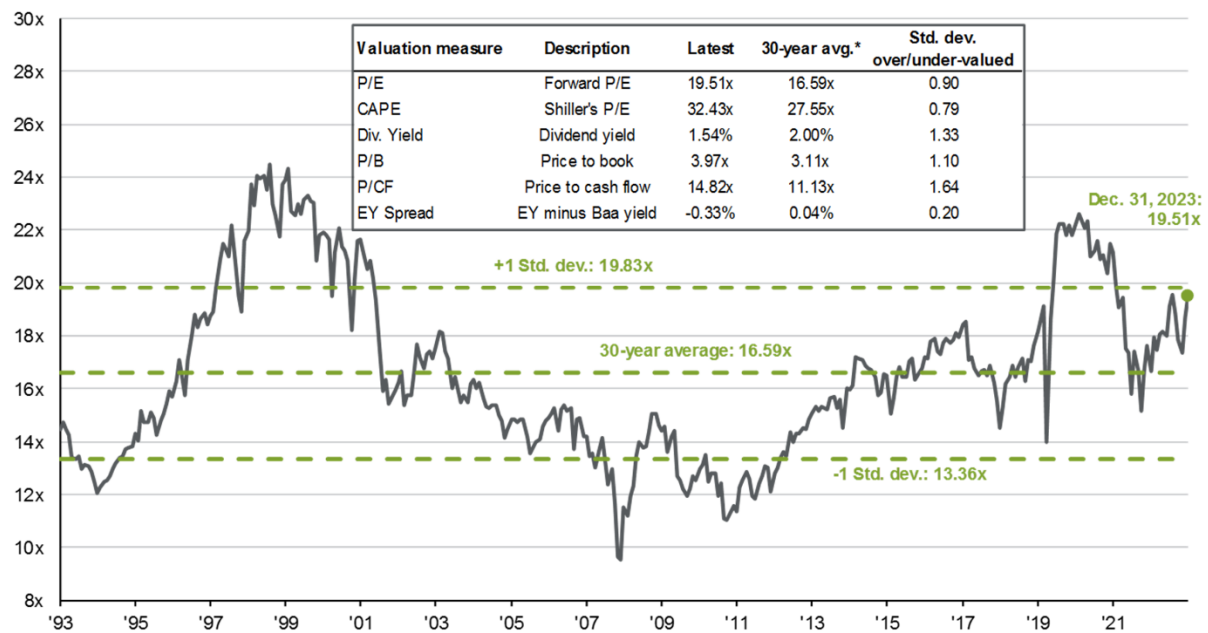
S&P 500 Index: Forward P/E ratio

This chart from J.P. Morgan Asset Management shows the market is currently overvalued by 6 different methodologies. It is possible we see a relatively stagnant market for several months, as shown in the election cycle chart, will make for more palatable valuations. What the chart does not consider is the current combination of strong employment, improving productivity, and the potential for lower interest rates as disinflation continues. These factors may very well set the stage for strengthening of earnings. We believe the case for a continued decline in interest rates will be supportive of the market at current valuation levels, barring a reacceleration of inflation.